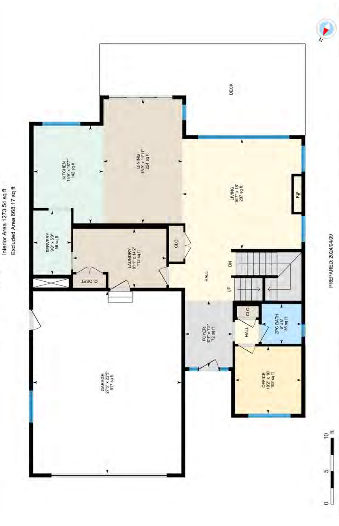
White regions are excluded from total floor area in iGUIDE floor plans. All room dimensions and floor areas must be considered approximate and are subject to independent verification.