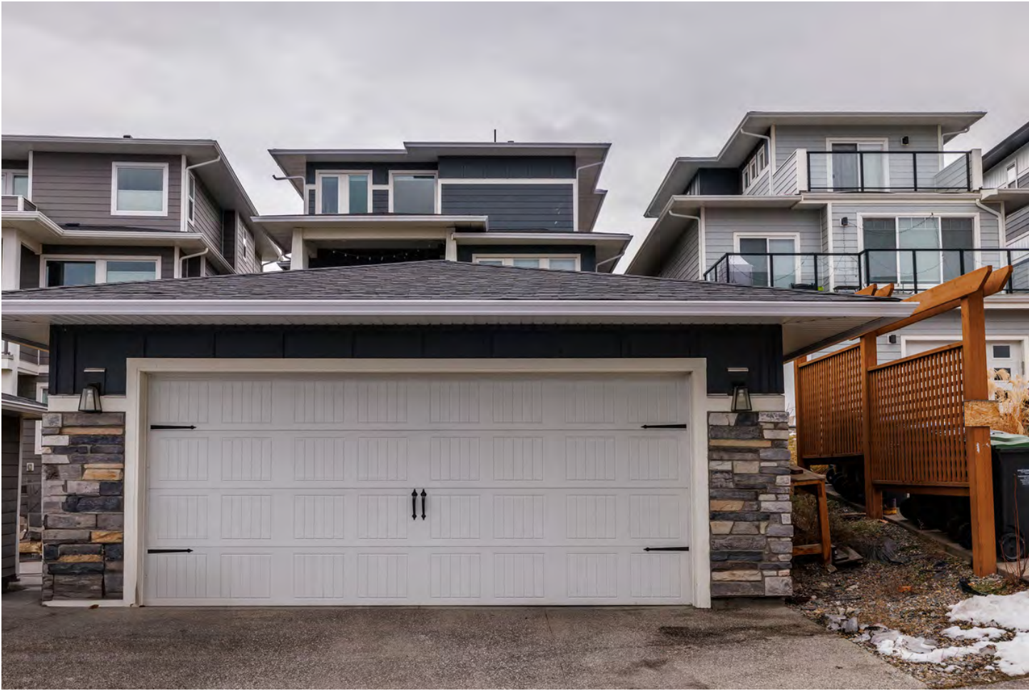
Garage Excluded Area 464.25 sq ft