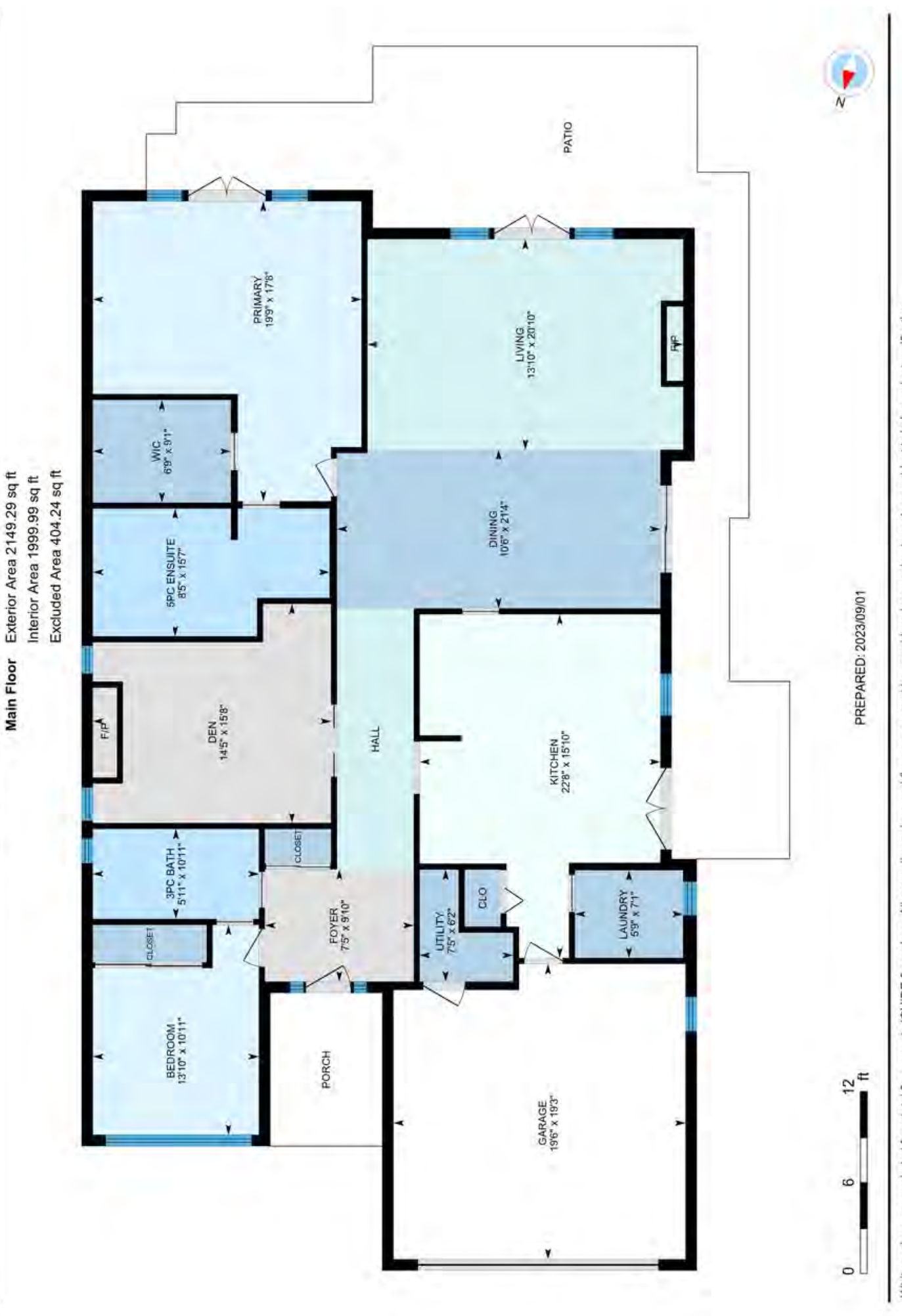
White regions are excluded from total floor area in iGUIDE floor plans. All room dimensions and floor areas must be considered approximate and are subject to independent verification.