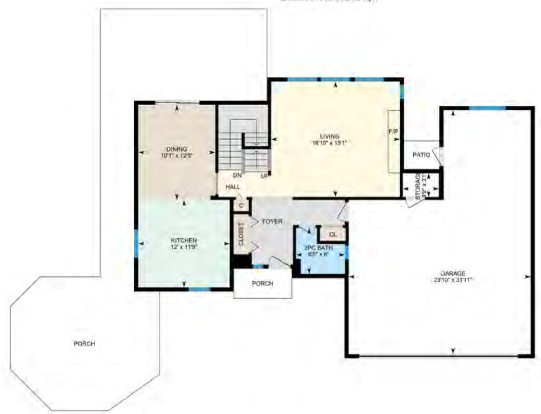
Upper Floor Exterior Area 1024.45 sq ft Interior Area 938.63 sq ft Excluded Area 120.57 sq ft

Main Floor Exterior Area 811,69 sq ft Interior Area 745,21 sq ft Excluded Area 682,02 sq ft