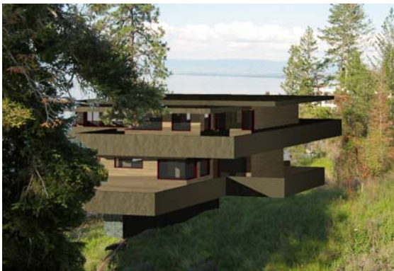
The building envelope is accessed by an easy driveway directly off of Lakeshore Road. The building site is very spacious with lots of room for storage and parking and for a spa/gym/outdoor kitchen and dining area on the west or south side. (Note: picture shows a concept house viewed from the Southwest with downtown Kelowna in the distance.)