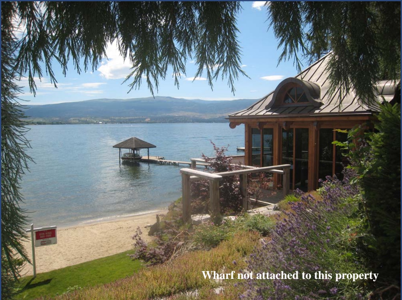
Wharf not attached to this property